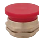
Part No. Description PC-5M-(color) 1 3/16-28 Thd., Mushroom (specify color)