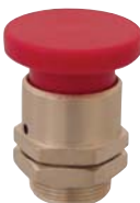
Part No. Description PC-3M-(color) 5/8-32 Thd., Mushroom (specify color)