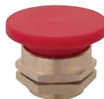
Part No. Description PC-4M-(color) 7/8-32 Thd., Mushroom (specify color)