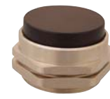
Part No. Description PC-5E-(color) 1 3/16-28 Thd., Extended (specify color)