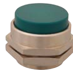
Part No. Description PC-4E-(color) 7/8-32 Thd., Extended (specify color)